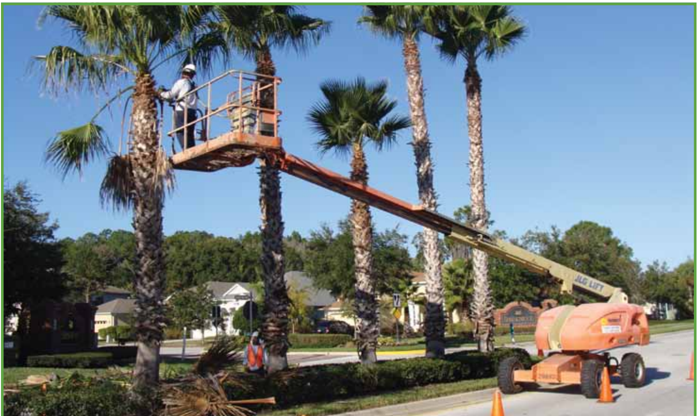
Vivicon uses a lift bucket to trim the palm trees twice a year.

employees at Seven Oaks five days a week to do the mowing, edging, and trimming. In addition, there are another 10-12 employees two days a week to mow, edge, and trim the parks.