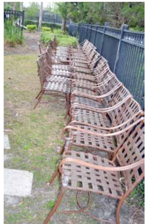
Dinning chairs that were replaced

Our maintenance staff, directed by Bob Semple, has also been hard at work pressure washing the cabana canopies and pool deck. Jeremy Hunt from the maintenance department has been instrumental in the implementation of these projects. The clubhouse interior and exterior has also been revitalized with a fresh coat of paint. This year the motor for the splash park finally had to be rebuilt at a cost of $2,000, and the clay tennis courts were resurfaced for $3,500."