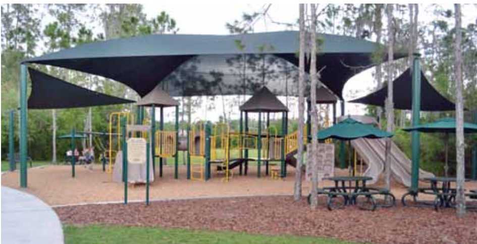
Clubhouse playground received repairs and upgrades after Hurricane Sandy last August