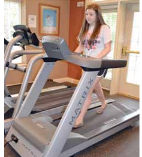
Resident uses new Matrix treadmill