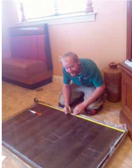
Jeremy Hunt working on cafe furniture