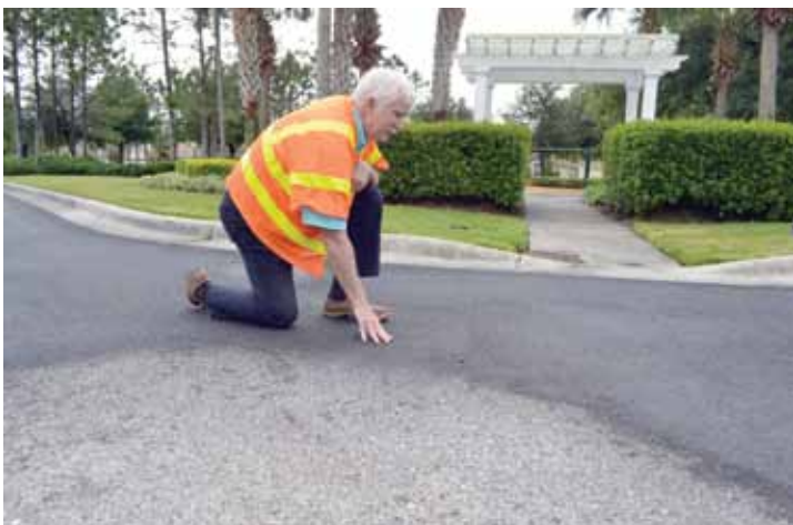
Jack monitors the sealing of the roads to insure they are done correctly