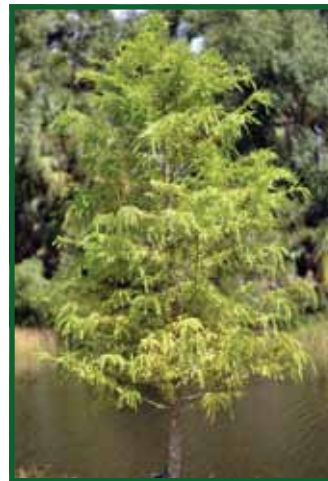
Bald Cypress Ancient Oaks Blvd at Brookforest