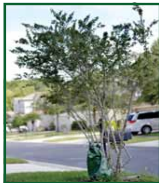
Walters Viburnum Coventry