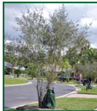
Yaupon Holly The Laurels