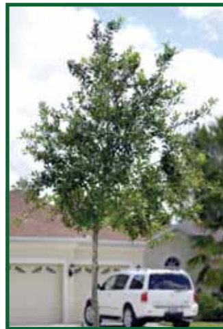
Nellie Stevens Holly Springwood