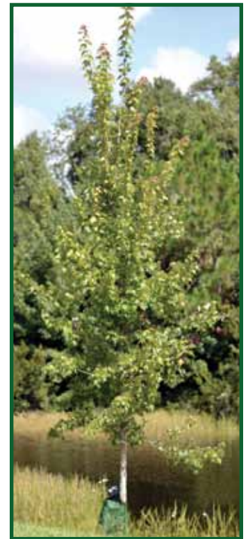
Red Maple Ancient Oaks Blvd at Brookforest