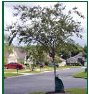
White Crape Myrtle Amberside