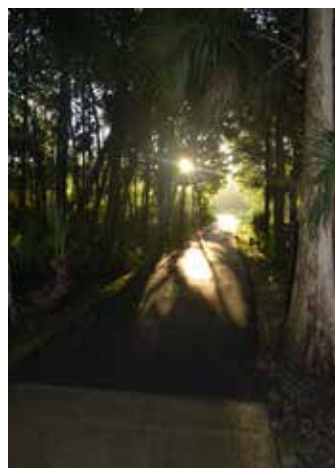
Nature trail between Amberside and Forest Edge at sunrise