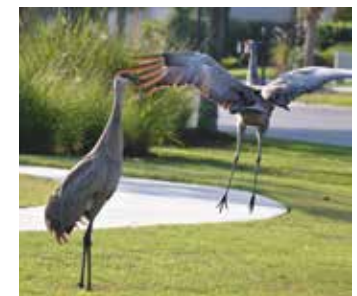
Sandhill cranes roam the park in Amberside