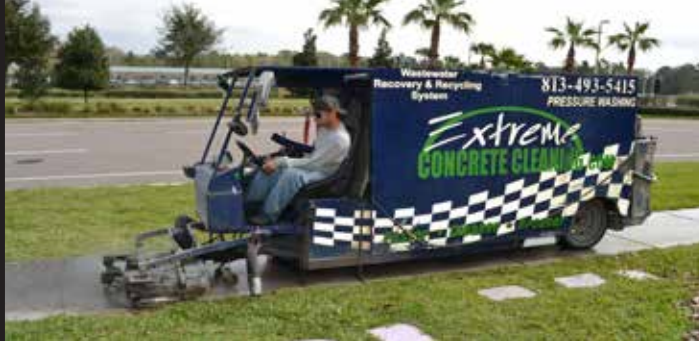
Above: Contractor cleans sidewalks on main road Below: Contractor replacing a section of a sidewalk in Coventry.