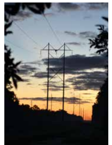
View of sunrise over power lines as seen from Ancient Oaks Blvd.