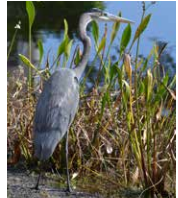
Great blue heron on pond beside nature trail in Edenfield