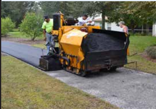
DuraSeal repaving the portion of the nature trail between Amberside and Coventry in November 2012

There is also a significant difference in the method of repair for the sidewalks and nature trail. The CDD hires a contractor as pictured above to replace the sidewalk when it becomes cracked or a section gets pushed up by a tree root too far to grind down by CDD maintenance personnel. For the nature trail, the entire 2 1/2 miles had to be repaved in November 2012 (see picture below). The CDD maintenance staff is currently replacing 3,600 boards on the 15 wooden bridges on the nature trail. With about 1,200 boards replaced, the board replacement project is about one third completed (see picture below).