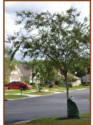
Yaupon Holly The Laurels