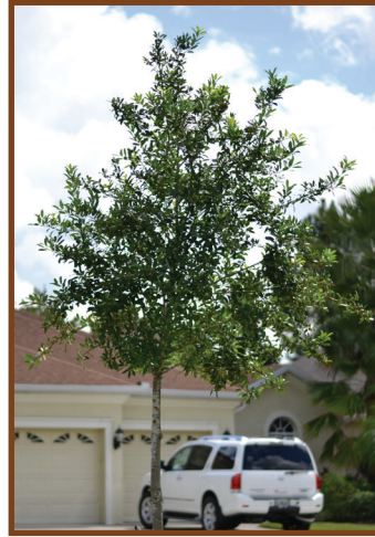
Nellie Stevens Holly Springwood

DECISION: At the June 10, 2015 CDD meeting, the Board decided to select Aventura with their bid being $8,252 lower and due to the problems of Arbor-Tech completing the Second Phase.