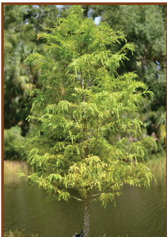
Bald Cypress Ancient Oaks Blvd at Brookforest