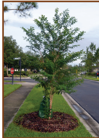
Lavender Crape Myrtle Edenfield