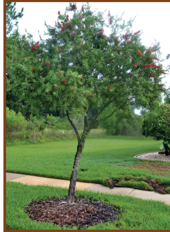
Bottle Brush The Laurels